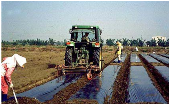
Fig. 4. Raised beds are formed and plastic mulch is laid in preparation for planting

Plastic mulch must be laid down before transplanting (Fig. 4); organic mulches can be laid down before or after transplanting. If plastic mulch is used, holes are cut in the plastic and plants are set directly into the holes. Reflective mulches will build up less heat in the soil than black plastic mulch and also provide some protection from aphids. During hot weather ( >25^{\circ}\text{C} nighttime temperature), cover plastic mulch with straw to reduce temperature in the root zone, or irrigate and drain the field frequently to keep temperatures down.