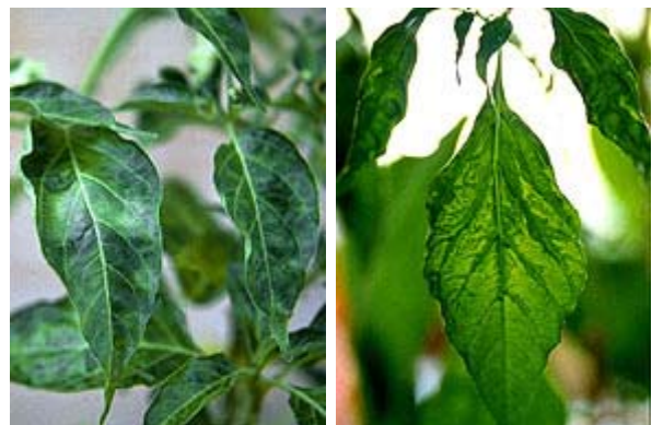
Fig. 11. Mottling of leaves caused by PVY and ChiVMV, respectively.

Symptoms vary, but generally these diseases show mosaic, mottled and/or deformed leaves (Fig. 11). Plants are stunted and the loss of marketable yield can be dramatic. To control, use resistant cultivars. Reduce the number of aphid vectors by controlling weeds, using insecticides, and using mesh netting to exclude aphids from seedlings.