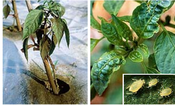
Fig. 13. Aphids (inset right) cause sooty mold and leaf distortion

These are small, succulent, pear-shaped insects that vary in color from yellow to green to black (Fig. 13). Aphids pierce leaves and suck the sap, causing foliage to become distorted and often curled under. Aphids exude a sticky substance that attracts ants and leads to the development of a sooty mold on plants. Aphids are vectors to many viruses, including ChiVMV, CMV and PVY. Control aphids by using reflective mulches, rotating crops, spraying with pesticides, or introducing predators and parasites.