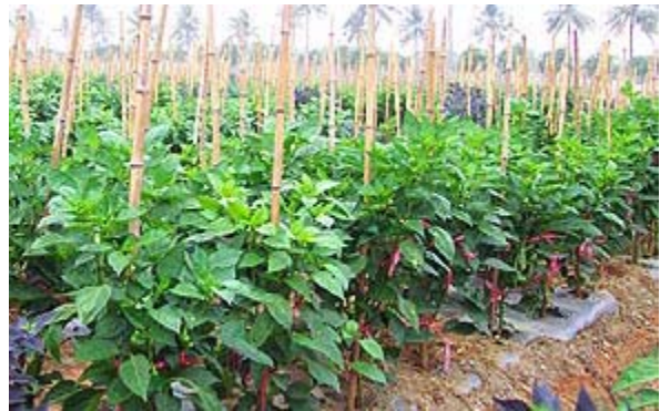
Fig. 5. Staked planting

Plants may be staked to prevent lodging, particularly when they have a heavy load of fruits. Each plant is individually staked before flowering stage (Fig. 5). Yields are generally higher with staking. Other staking and training techniques may be used based on local experience.