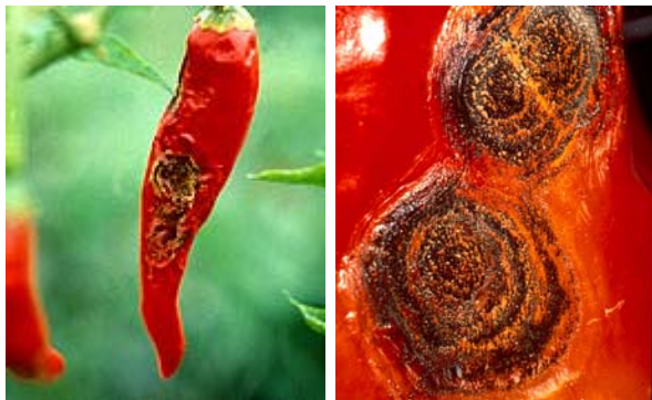
Fig. 6. Anthracnose lesions on mature fruit

To control anthracnose, use pathogen-free seed and rotate crops. Fungicides can reduce losses. Since symptoms usually occur on mature fruit, harvest and utilize fruit in the immature green stage, or harvest mature fruit frequently and process quickly.