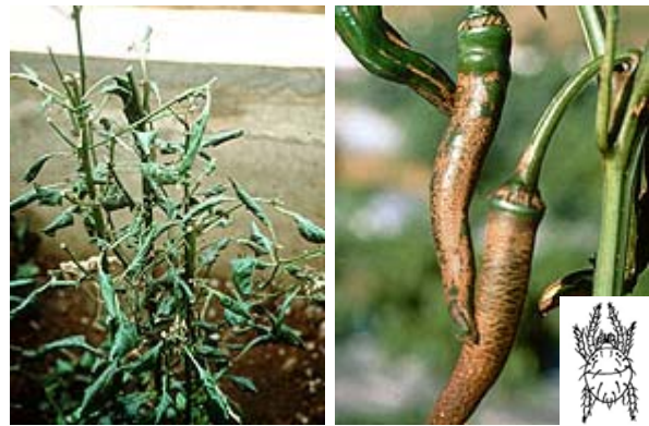
Fig. 14. Mites (inset right) cause leaves to curl downwards and corky tissue to develop on fruits

This pest is controlled through the use of tolerant cultivars, weed control, crop rotation, and miticides such as abamectin and dicofol.