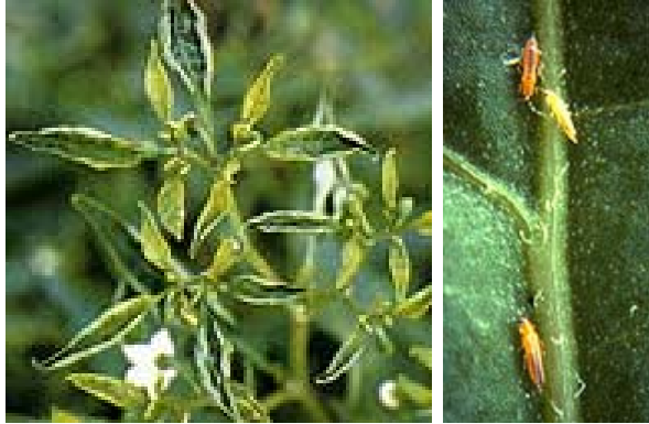
Fig. 15. Thrips cause leaves to curl upwards; they are often found near the mid-vein of leaves.