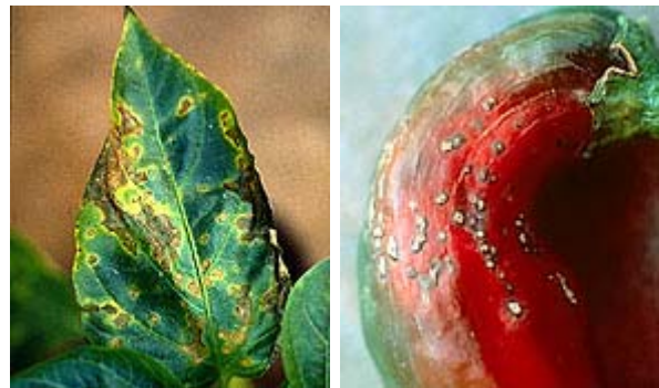
Fig. 7. Bacterial spot lesions on leaf and fruit

To control this disease, rotate pepper with cereals and other non-susceptible crops. Use pathogen-free seed and transplants. Resistant cultivars are becoming available, but may not be resistant to all strains of the disease. Sprays of copper or copper + maneb will reduce damage. Rain shelters may reduce the severity of disease during rainy periods.