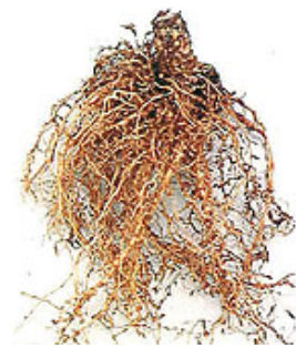
Fig. 17. Knotted, galled pepper root system

This nematode damages the root system. Infested plants become stunted and yellowed. Severely affected plants may wilt. A careful look at the root system will reveal small galls (Fig. 17). This nematode has a very wide host range. Its eggs can remain dormant for a few months. Warm tem-