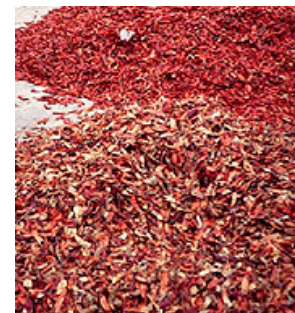
Fig. 18. Peppers drying in the sun

For dry chili, it's important to preserve the red color of the mature fruits. Drying them in the sun is a common practice (Fig. 18), but this tends to bleach the fruits, and rainfall and dew promote fruit rot. Solar dryers have been developed, but they require fairly constant sunshine. Cloudy weather increases the drying time and the risk of post-harvest spoilage. Blanching the fruits in hot water (65°C) for 3 minutes and removing the pedicel and calyx can decrease drying time, increase color retention, and reduce post-harvest losses. In general, cultivars with low dry matter content and/or thick flesh are difficult to dry and are generally sold fresh. If ovens are available, dry fruits for 8 hours at 60°C, then reduce the temperature to 50°C and continue until fruits are completely dry (about 10 more hours).