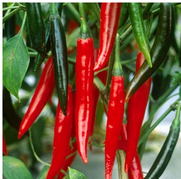
Fig. 1. Chili pepper

Chili pepper yields vary widely depending on cultivar and season. It's important to consider fruit quality,