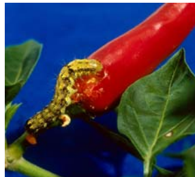
Fig. 16. Fruitworm larva boring inside pepper

To control, spray insecticides to kill exposed larvae. Remove infested fruits to reduce pest populations.