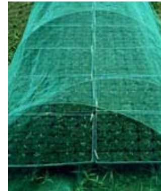
Fig. 2. Seedlings growing under mesh net

Sow one seed per cell (or broadcast the seeds lightly in a seedbed) and cover 1 cm deep. Cover the seedlings with an insect-proof net (Fig. 2), or sow them inside a greenhouse or screenhouse. This provides shade and protects seedlings from heavy rain and pests, such as aphids, which transmit viruses. Upon emergence, water the seedlings thoroughly every morning or as needed (not too wet, not too dry), using a fine sprinkler. Irrigate with a 0.25% (w/v) solution of water-soluble or liquid fertilizer (10-10-10) when two true leaves appear. If damping-off occurs, irrigate with a 0.25% (w/v) solution of Benlate or similar fungicide.