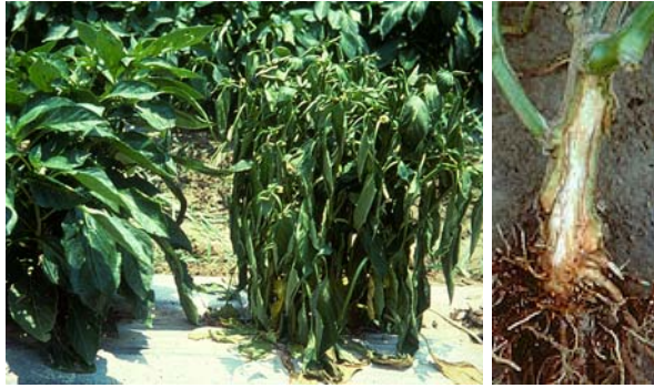
Fig. 8. Healthy and bacterial wilt-infected plant; browning of inner vascular tissue

To control bacterial wilt, use pathogen-free seedbeds to produce disease-free transplants. Fumigate seedbeds and pasteurize the planting medium for container-grown plants. Rotate with flooded rice; rotation with non-susceptible crops provides limited value. Avoid cultivation that damages roots. Use raised beds to facilitate drainage. Resistant cultivars are being developed.