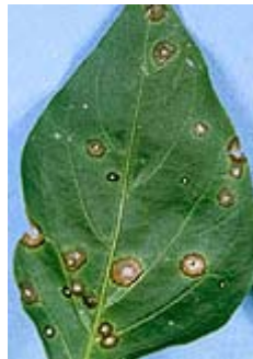
Fig. 9. Cercospora "frog eye" lesions

Its "frog eye" leaf lesions are circular, about 1-cm in diameter, with brown borders and light gray centers (Fig. 9). Severe infection can cause leaf drop, with or without leaf yellowing. Lesions also appear on stems, petioles and peduncles; fruit do not become infected. The fungus survives from one season to another on crop debris. Extended rainy periods and close plant spacing enhance development. Fungicides are usually only necessary during conditions highly favorable to the disease.