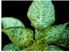
Fig. 12. Leaf crinkling caused by PMMV

These diseases are transmitted in and on seeds, as well as through contact of plants. Symptoms include stunting, leaf mosaic and crinkling (Fig. 12), and systemic bleaching of leaves. To minimize problems, use resistant varieties and pathogen-free seeds. Dip tools in milk or TSP before handling plants.