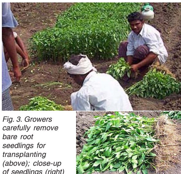
Fig. 3. Growers carefully remove bare root seedlings for transplanting (above); close-up of seedlings (right)

Bare-root seedlings are lifted from the seedbed by loosening the soil with a spading fork, and carefully separating the roots from the surrounding soil, discarding damaged or inferior plants, and binding into convenient bundles for transport to the field (Fig. 3). The seedlings should be kept cool, moist, and shaded between the lifting and transplanting tasks.