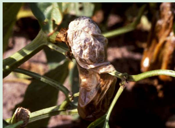
Collapsed, hanging, rotting fruit