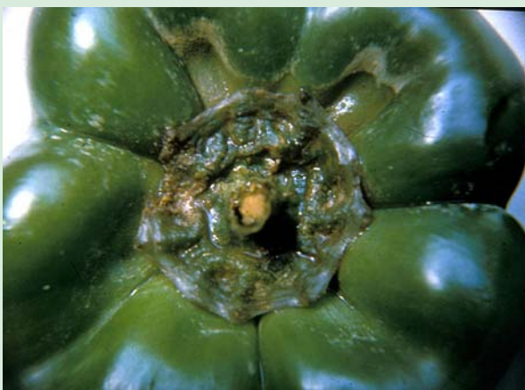
Post-harvest softening of stem end of fruit